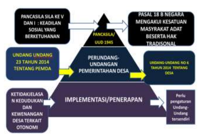
Figure 1. Village Government Law Politics

Based on the picture above, the presence of the state is expected to guarantee that the existence of the village is truly intended for the realization of the Indonesian people, especially prosperous rural communities. Directions in the formation of laws, regulation of customary law communities are contained in the provisions of Article 18B paragraph (2) and Article 18 paragraph (7). However, regarding the authority of the customary law community unit, it refers to the regulation of ulayat rights which are still contained in the provisions of sectoral legislation.